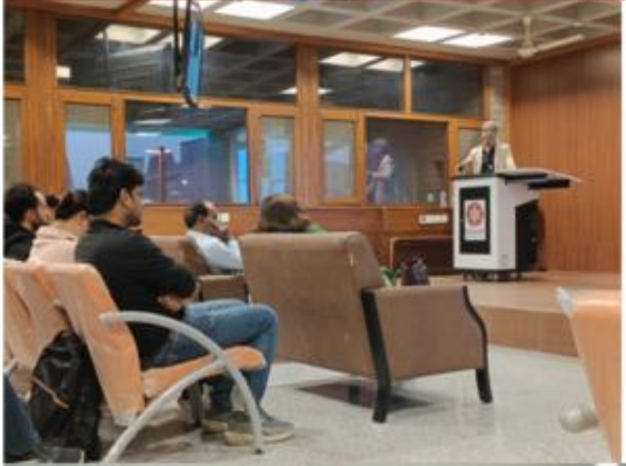
Workshop, Nalanda University, Bihar, 2023