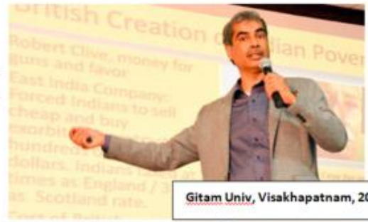
Gitam Univ, Visakhapatnam, 2016