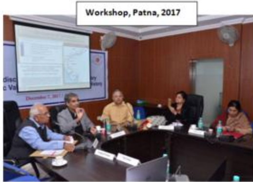
Workshop, Patna, 2017