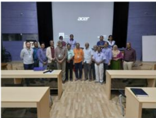
Workshop, Vellore Institute of Technology, 2023