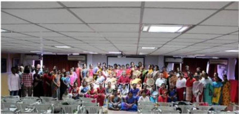
Workshop, Chennai, 2022