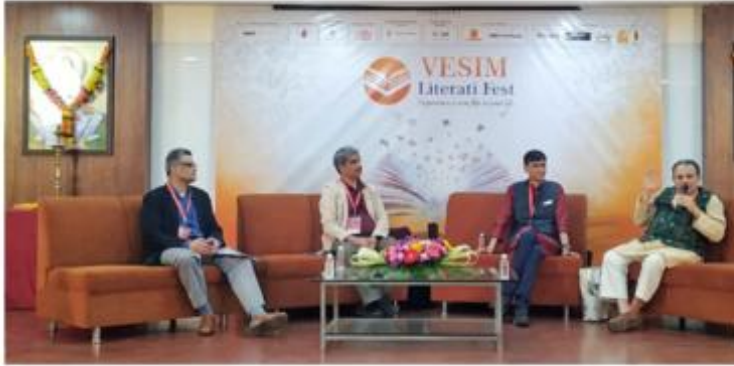
VESIM Literati Fest, Mumbai, Jan 2020