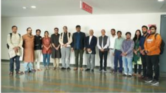
Short Term Course, Rishihood University, Haryana, 2023