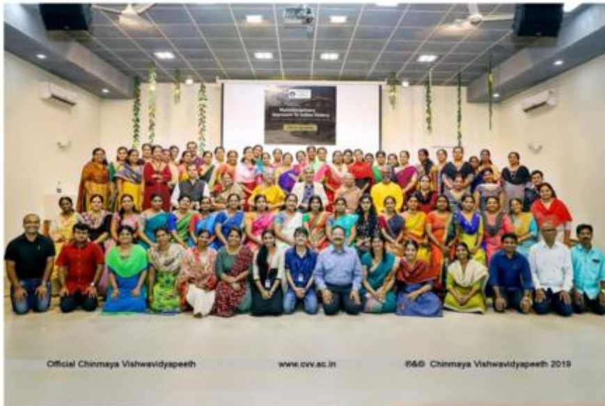
Workshop at Kochi, 2019