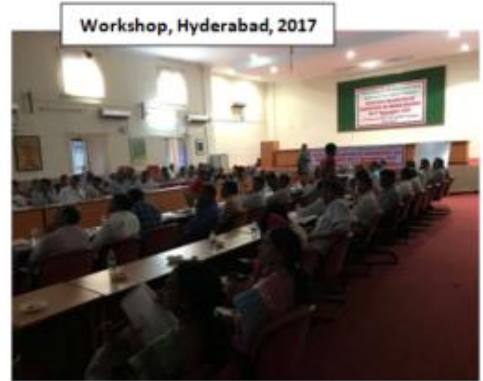
Workshop, Hyderabad, 2017