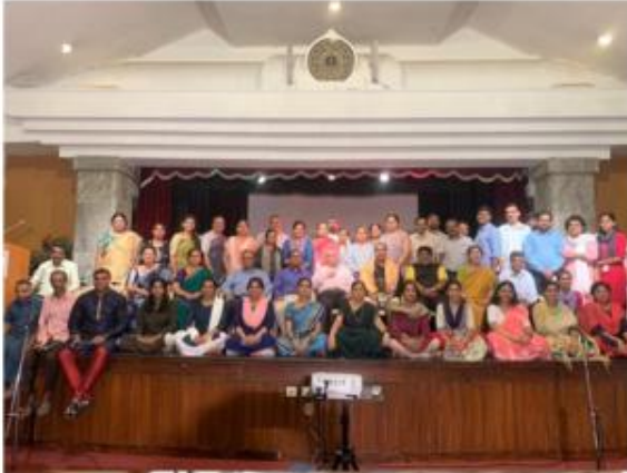
Workshop, Bharatiya Vidya Bhavan, Bengaluru, 2022